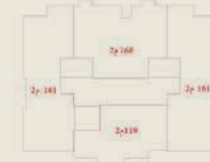
أبعادي مساحة الدور المتكرر = 2٠600