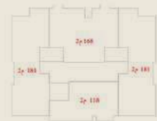
أبعادي مساحة الدور المتكرر = 2٠648